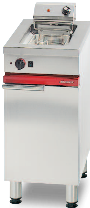
CME 415 FR. 6-litre electric fryer - 4.5 kW.